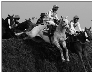
Scots Grey continues the exceptional record of strongly-fancied horses in the Fox Hunter's Chase